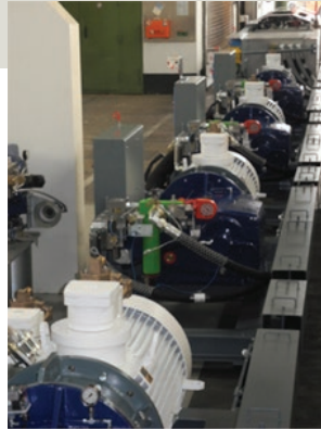
Hauhinco supplies mining companies across the globe with high-pressure pump and water spray stations.

No other supplier could offer the same level of end-to-end coverage right down to the machine level. Siemens PLM Software's partner A+B Solutions took care of the integration of the systems into the production chain using the ShopFloorConnect® asset utilization software add-on, which gives users direct access to all relevant production data saved in Teamcenter, such as NC programs, tool lists, production documentation and 3D models.