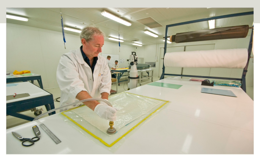
Shown is a stage in the layup process at Quickstep. Fibersim creates the flat pattern shape for the cutting machine to cut out. This ensures that the flat patterns can be accurately and efficiently laid up to create the composite part.

Michael Schramko Chief Operating Officer Quickstep