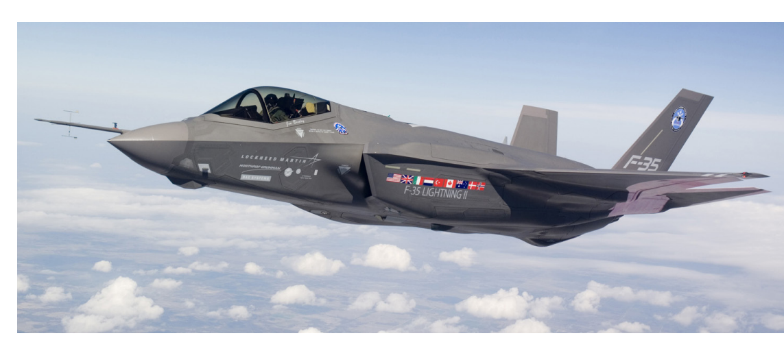
Quickstep uses Siemens PLM Software's Fibersim to manufacture the largest and most complex parts the company has produced to date for the newest generation of the JSF, the F-35 Lightning II.

Quickstep received its first purchase order in July 2011, covering production of smallto medium-size JSF components of inter-