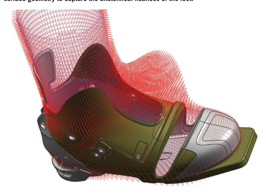
Heavy FEA use was instrumental in achieving performance goals on Black Diamond's freetouring ski boots.

more weight with the older design after we did the (FEA) analysis," says Brendan Perkins, design engineer at Black Diamond. Starting with a clean slate, the engineering team gave the designers a basic mockup of what the ice tool's wall thickness should be along with other critical design elements like pick angle and approximate shaft size. Using the same iterative design workflows, the team came up with a new hydroformed aluminum shaft design that was 9.4 percent lighter.