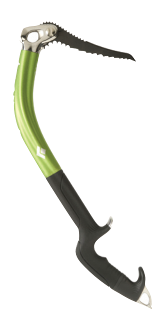
Black Diamond's Fusion technical ice tool is another example of a redesign project that benefited from the early integration of engineering and industrial design.

gains won't come through those means. If you're not using tools like FEA, you've already fallen behind or you rapidly will."