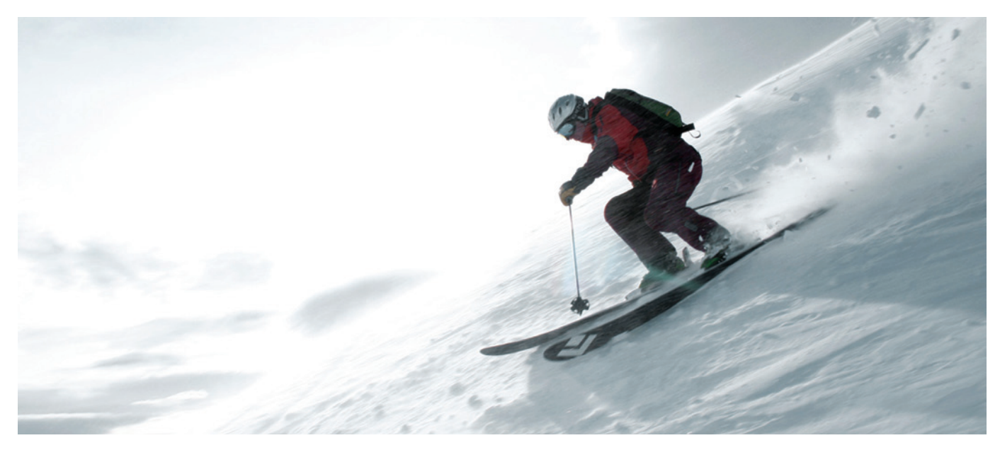
Black Diamond customers, mostly elite skiers, are looking for performance and reliability when it comes to their gear.